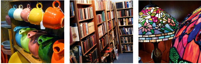
COMPLIMENTS OF THE COLUMBUS AREA VISITORS CENTER